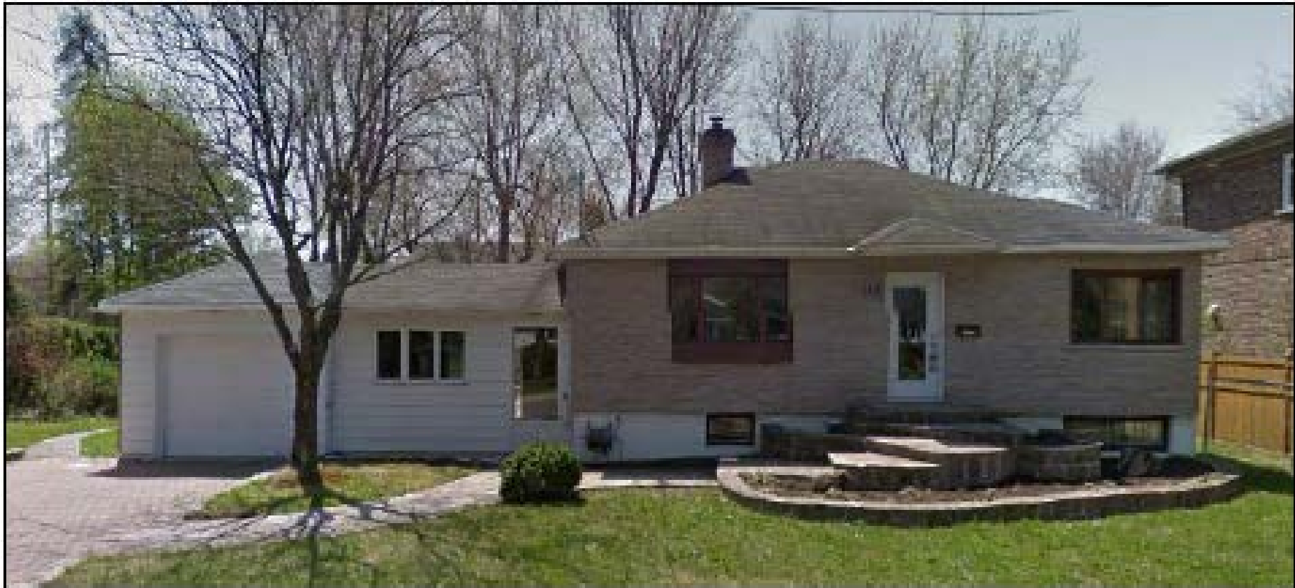
Photo du bâtiment existant